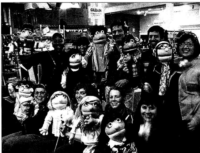
The "Ace of Cakes" crew with their puppets.

The puppets had their unveiling and debut on an episode of the show in which the bakery crew was creating the components of a cake that they would fly over to Hawaii and assemble on location. It was for the cast and crew of the TV series, "Lost", to celebrate their 100th episode. The cake-makers all took time out to admire and pose with their puppets.